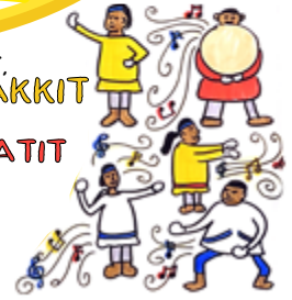
Nigit'stil Norbert'mit 2021