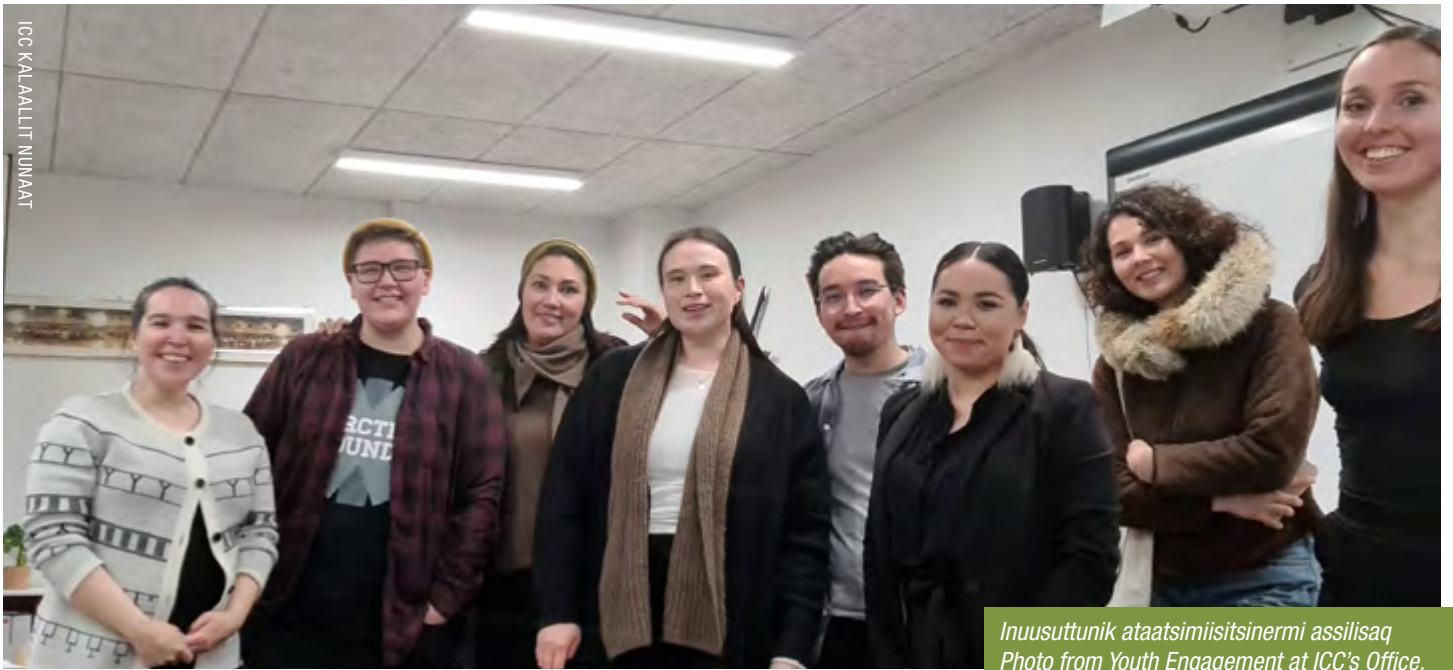
Inuusuttunik ataatsimiisitsinermi assilisaq Photo from Youth Engagement at ICC's Office.