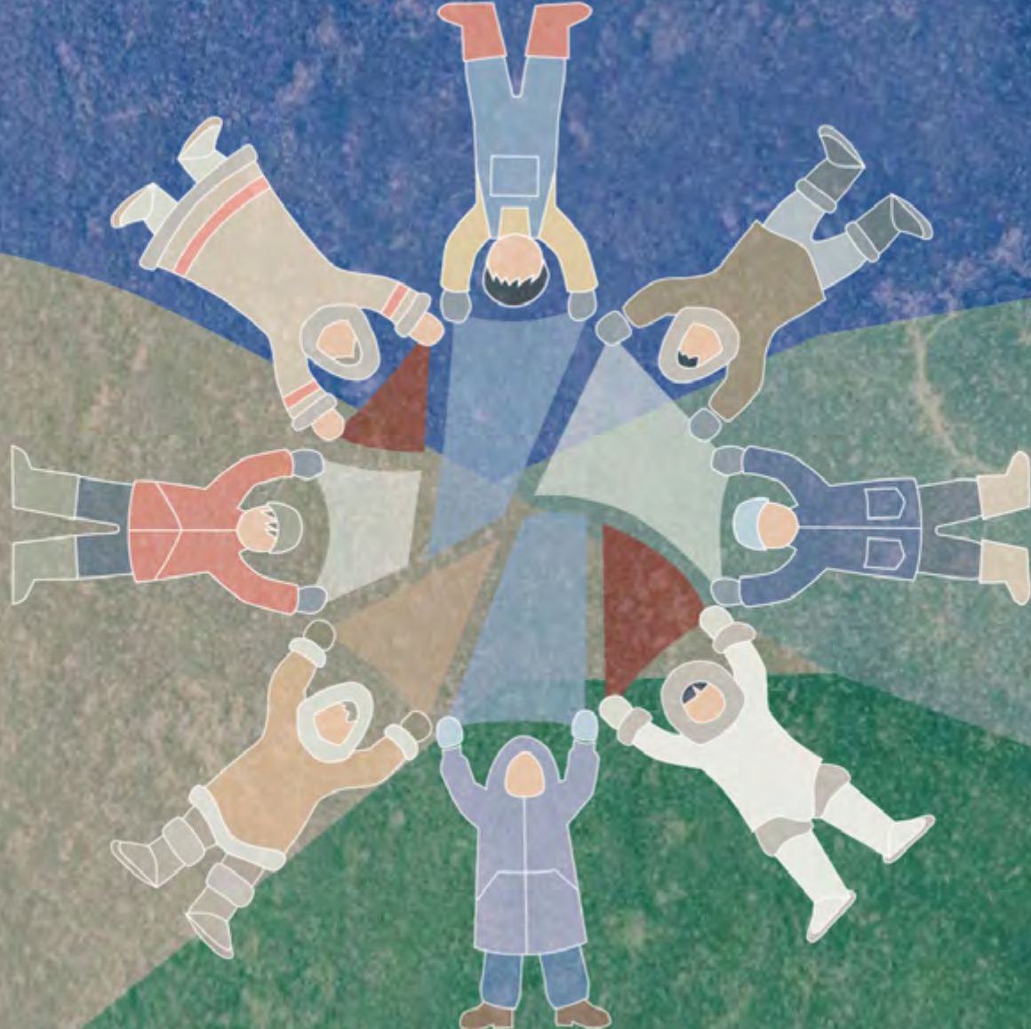
Nunap inoqqaavisa ilisimasaannik atuinermi naligiisitsinissaq, ileqqorissaarnissaq peqataatitsinerlu pillugit najoqqutassiap saqqa. Front page on Ethical Equitable Engagement Synthesis report.