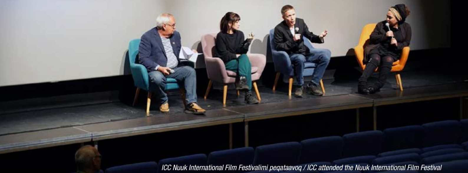
ICC Nuuk International Film Festivalimi peqataavoq / ICC attended the Nuuk International Film Festival