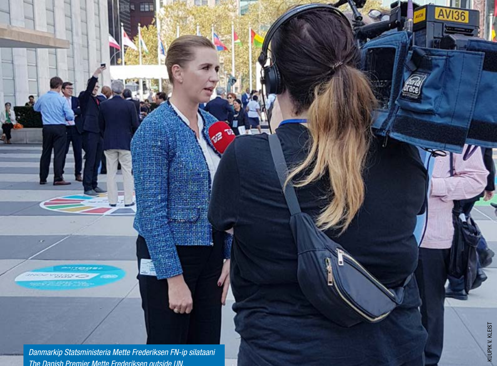
Danmarkip Statsministeria Mette Frederiksen FN-ip silataani The Danish Premier Mette Frederiksen outside UN.