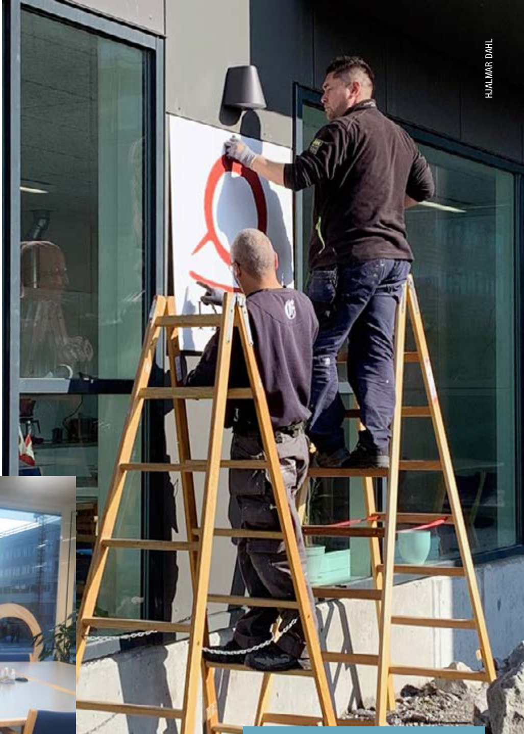
ICC-p logo-a allaffittaami nivinngarneqarpoq. ICC logo is being put to the wall.