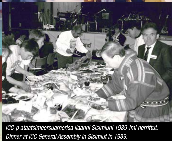
ICC-p ataatsimeersuarnerisa ilaanni Sisimiuni 1989-imi nerrittut. Dinner at ICC General Assembly in Sisimiut in 1989.

ICC-p nutsernermini assitoqqanik nassaani ilanngullugit saqqummiutilaarpai. While moving out we found some old photos we would like to share with you.