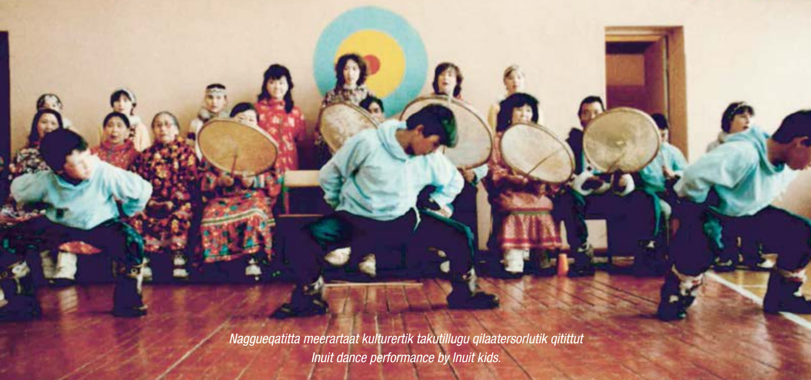
Naggueqatitta meerartaat kulturertik takutillugu qilaatersortutik qitittut Inuit dance performance by Inuit kids.