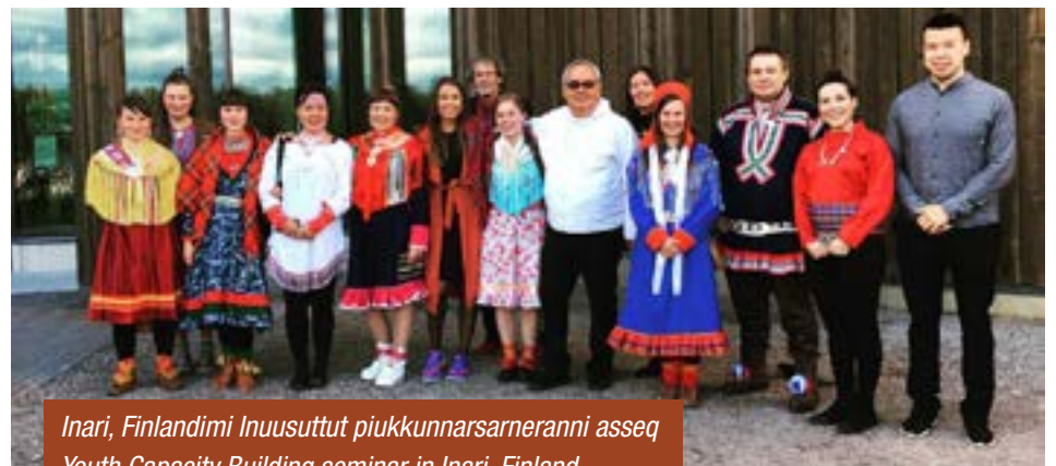
Inari, Finlandimi Inuusuttut piukkunnarsarneranni asseq Youth Capacity Building seminar in Inari, Finland

“Ever since I learned about ICC, ICC has been my dream job, so I am very happy and proud that I am now working here. I already love and look forward for future work here”