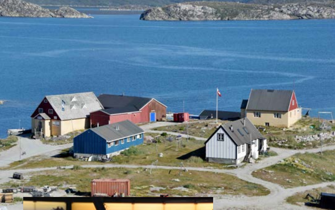
'Nuori Karjala' kattuffimmeersut Kapisilinnut takornartinneqarput. Boat trip to Kapisillit with 'Nuori Karjala' organization. August 2017.