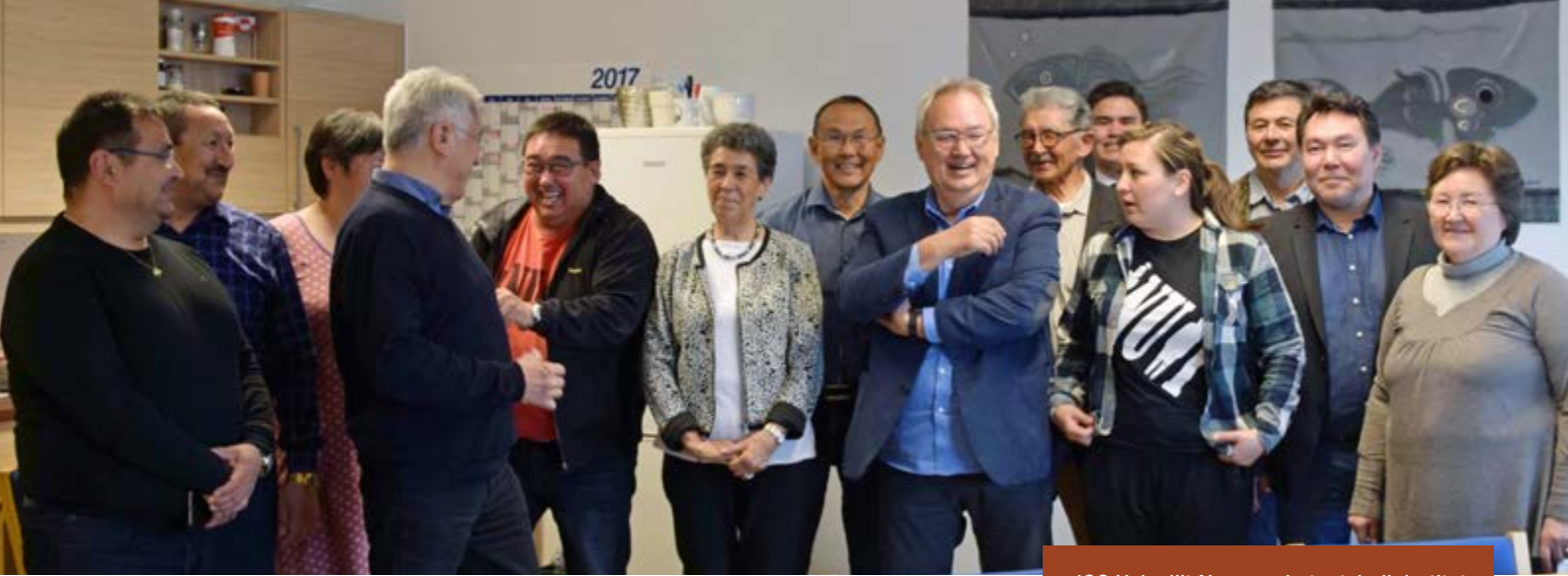
ICC Kalaallit Nunaanni ataatsimiigiartitat ICC Greenland delegates. May 2017.