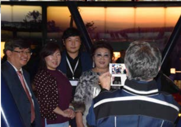
Finlandimi Inarimi SDWG-it ataatsimiinne-rannit peqataasut Ruslandimeersut. Russian delegates at the SDWG meeting in Inari, Finland. September 2017.