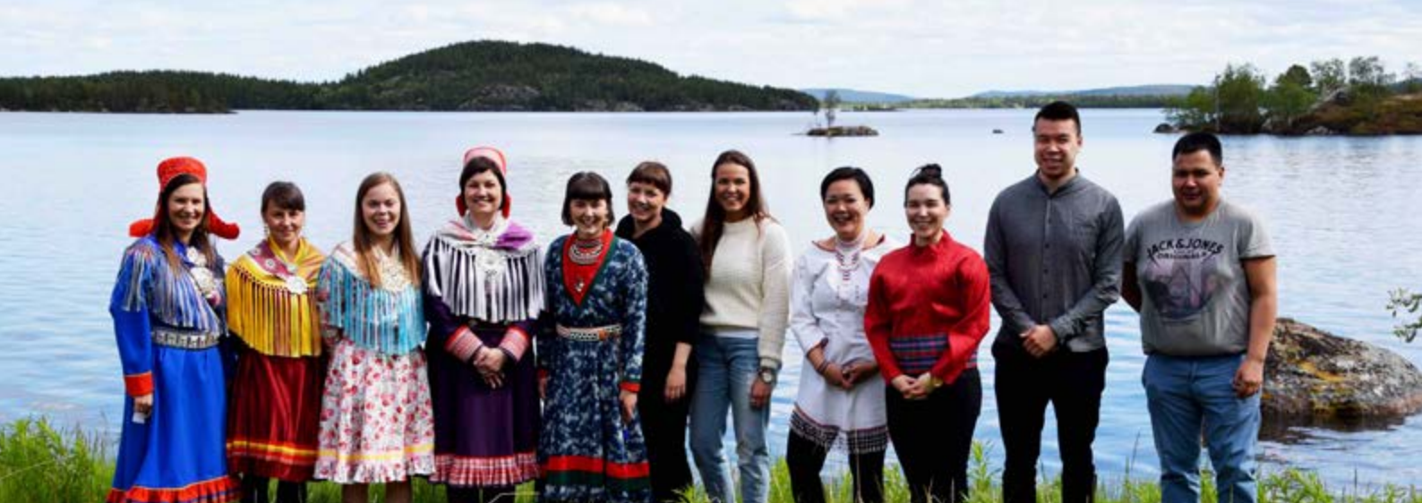
Saamit Inuillu inuusuttaasa peqatigiittumik ingerlassaanni tullermi peqataasut Inarimi Saamit Siunnersuisoqatigiiffianni Siulittaasoq Norgemilu Saamit Inatsisartuini siulittaasoq naapikkaat / Saami and Greenland students at the second Joint Saami-Inuit Project receiving the Saami Council President and the President of the Norwegian Saami Parliament, Inari, June 2016.