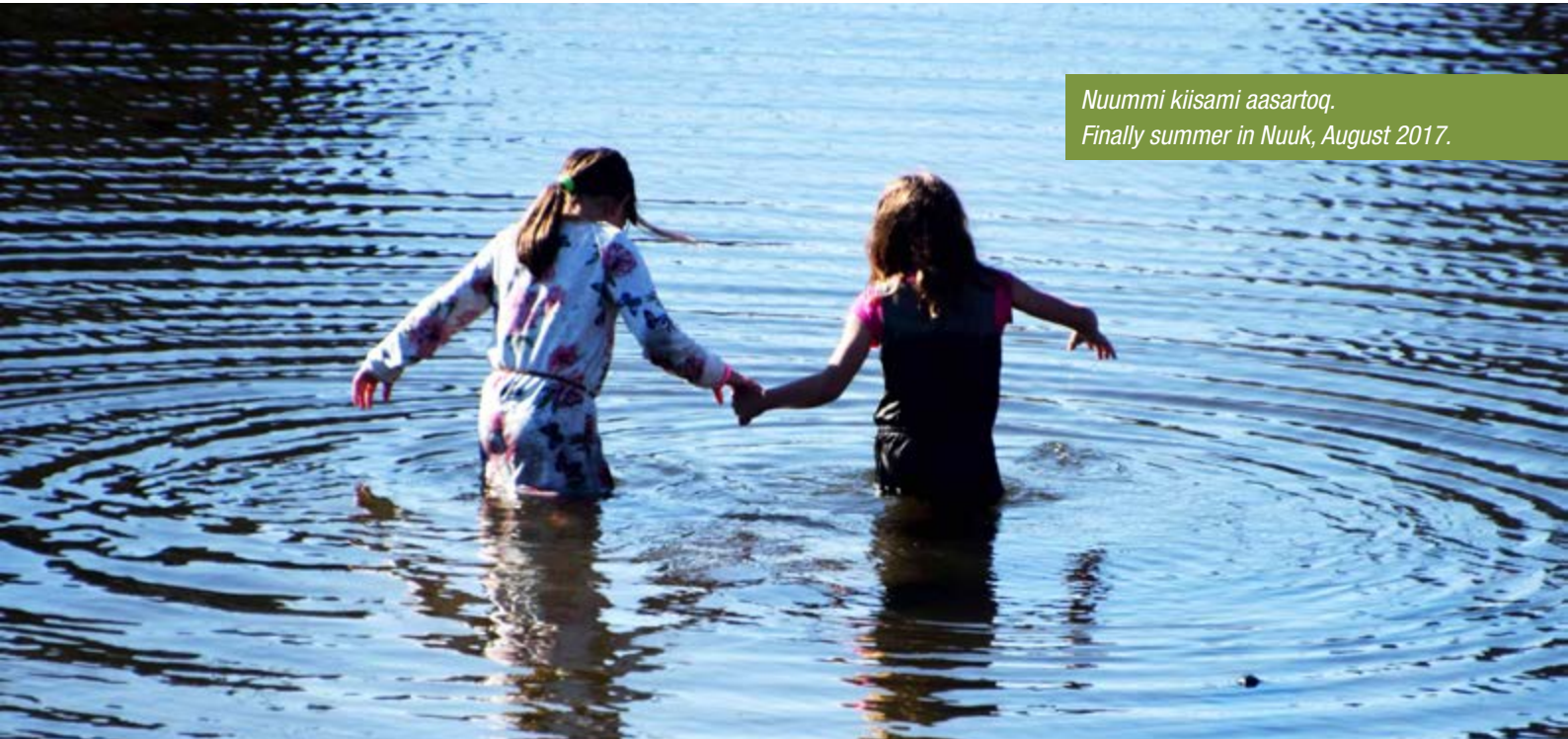
Nuummi kiisami aasartooq. Finally summer in Nuuk, August 2017.