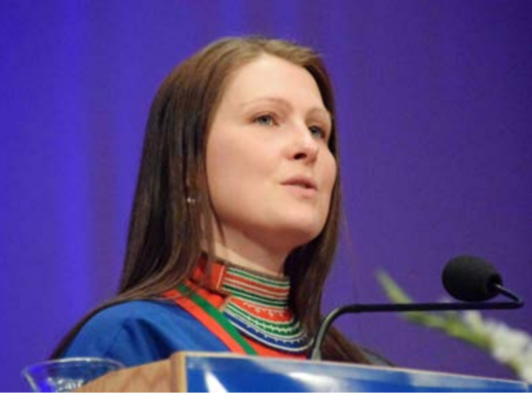
Åsa Larsson-Blind, Saamit Siunnersuisoqatigiiffianni Siulittaasoq Saamit Sverigemi najugallit sinnerlugit Oulumi Finlandimi peqataasoq Åsa Larsson-Blind, President of the Saami Council representing the National Union of the Swedish Saami People. Oulu, Finland, June 2017.