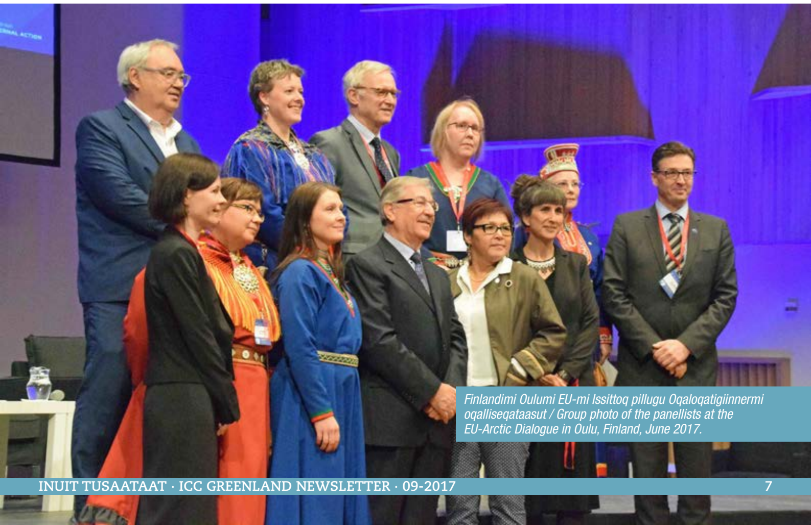
Finlandimi Oulumi EU-mi Issittoq pillugu Oqaloqatigiinnermi oqalliseqataasut / Group photo of the panellists at the EU-Arctic Dialogue in Oulu, Finland, June 2017.